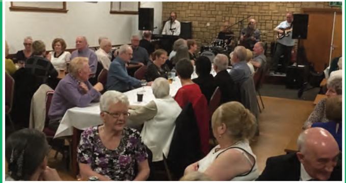
LEFT: St Aidan's, Wishaw holds a pensioners treat in the Church hall. RIGHT: St Ninian's and St Cuthbert's, Hamilton senior parishioner's annual dinner.