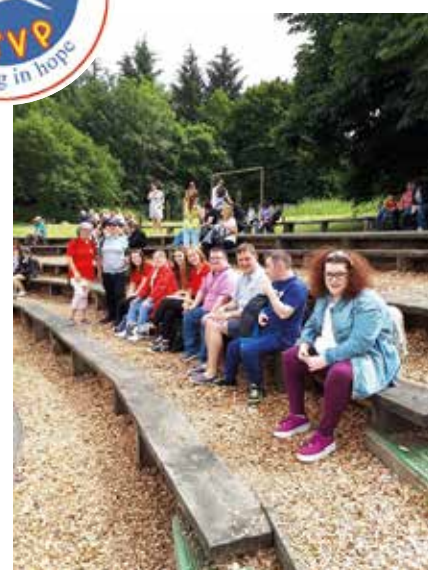
(SSVP Youth Members who volunteer at Paisley Ozanam Club on a trip to Blair Drummond Safari Park in June 2019.)