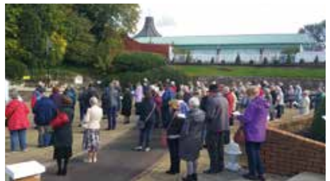
St Josephs Carfin

The Burntisland Conference run a bus every year to Carfin for the annual SSVP Mass. This includes our parishioners. We open it out to other churches in the area, mainly St. Margaret's in Dunfermline and St. John & St. Columba in Rosyth. This is proving very popular and we supply a packed lunch for those attending. We all enjoyed the day and the weather was on our side which is a blessing, especially for outside events. Looking forward to next year as it will be the Carfin Centenary.