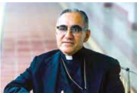
St Oscar Romero, champion of the El Salvadoran poor, reminds us: “When we speak for the

In the heart of the pilgrim People of God there beats that saving power which excludes no one and involves everyone in a real journey pilgrimage of conversion to recognise the poor and to love them. In fact, the eternal destiny of human beings will be measured by how much or how little solidarity we have displayed with the hungry, the thirsty, the naked and the oppressed. In the end we will be judged in terms of love.