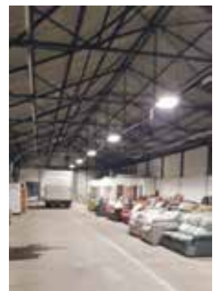
MW Furniture Depot

We are at the start of a new and exciting journey in the history of the Furniture Unit. Our volunteers today, are as convinced as those in the past, that our Furniture Unit is an essential resource in helping those in need in our Community. With the grace of God, St Vincent De Paul plus the wonderful dedication of all the volunteers, we will continue to be of service to those in need for many years to come and grow from strength to strength. Indeed, as St Vincent de Paul reminds us: 'How much our hearts should be on fire with love of this ministry of helping the poor and devoting ourselves earnestly to it, for the need is so great and God expects this of us.'