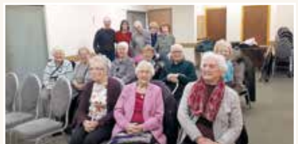
PHOTO: "Sunday Movie Matinee" in our church hall.

The program tends to run between March and early October with a "Christmas Special" in late November or early December.