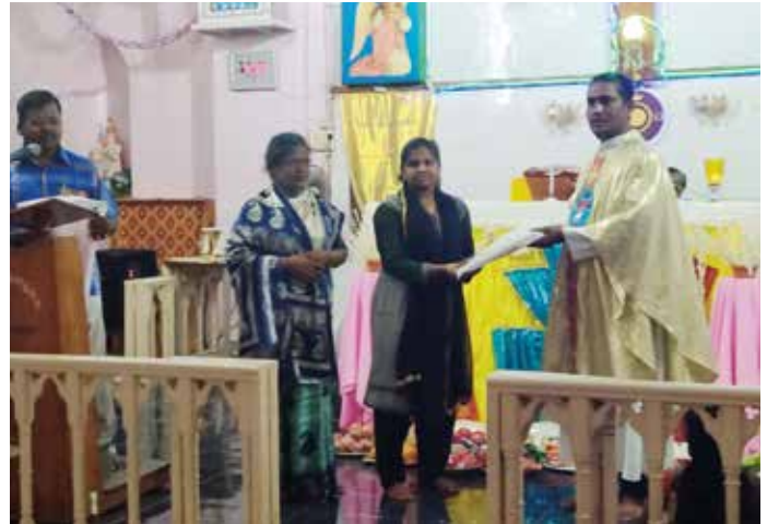
Twinning BVM Assumption Perumal palayam India

Amidst this difficult time, by the people’s contributions, we bought clothing for 13 school children at a cost of Rs.7000/. In addition, we supported two students with Rs.250/ in cash as their education fund. In this pandemic, our India has suffered a lot. We came in the top among the affected nations. Here people are very much affected by this virus. They really need financial assistance very much for their basic needs.