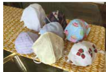
Shirts re-purposed as masks.

shops opened, I started to make masks using shirts, tea towels and bed linen donated by friends and family. I then put the finished masks into a polythene bag with a SSVP sticker on it and gave them into our parish church for anyone who might need/want one. Donations for SSVP were welcome but not essential by any means. It’s been hard to know how much money each mask has raised but over the course of time since lockdown, donations have continued. I hope they have helped maintain the profile of our work during these challenging times.”