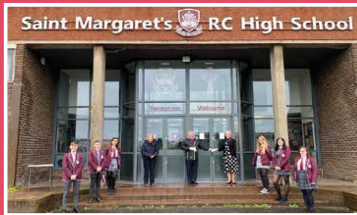
St Margaret's receiving cheque for uniforms.

Linking with Airdrie Foodbank in partnership with Scottish Gas employees, members delivered food to families in need and also helped financially with utility