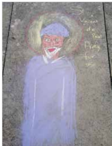
Chalk picture of St Vincent in purple.

Lockdown has been a challenging time at SSVP Youth. Our plans for Mini Vinnie and Youth days had to be shelved and most disappointing of all was not being able to visit schools and spend time with our wonderful young people.