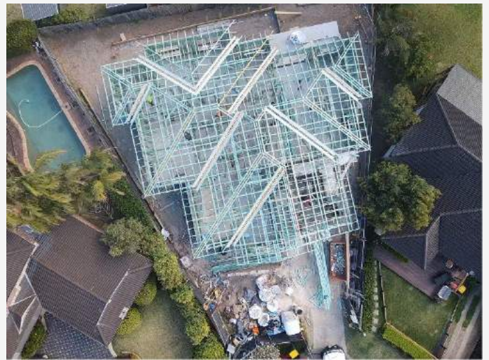
New house in Ryde