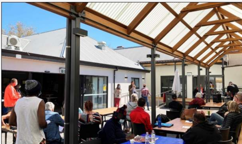
Our monthly Town Hall meetings create an important sense of community for people at risk of or experiencing homelessness in South Australia.