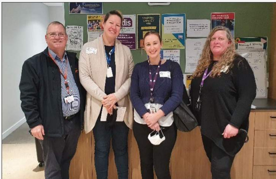
Staff from the Australian Electoral Commission and the Electoral Commission of South Australia are helping people register to vote for upcoming State and Federal elections.

It's a small but important step towards our vision of an end to homelessness.