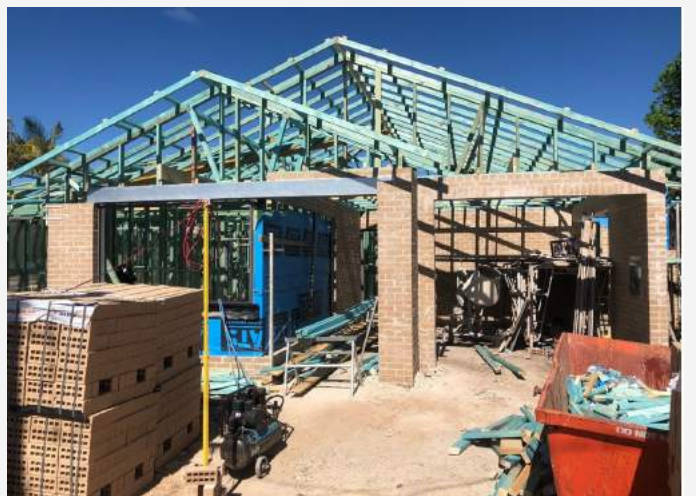
New house in Ryde