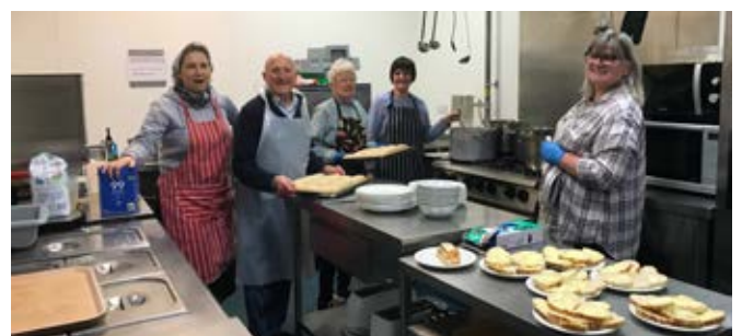
1 of the 4 kitchen teams at OLW, Paisley

The 'Lunch Club' within the St Mirin's Cathedral halls, Incle St, Paisley, runs every second and fourth Monday of each calendar month 1330-1600. It has an Open-Door policy aimed at those who are sixty years or above though some younger people attend. Patrons enjoy Tea/Coffee/non-alcoholic beverages, wholesome hot soup and sandwiches as well as a quiz, bingo and other light entertainment. The 'Lunch Club' is a new venture and on a three-month pilot programme but is already proving very successful.