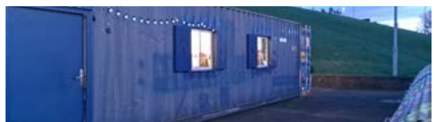
LCK Light in the darkness

Without a doubt the greatest strength of this project is its support from the volunteers and all the Conferences in the Glasgow NG. Those Conferences whose members cannot be there physically are providing other very valuable support e.g., financially and/or spiritually. And it is the latter which reminds us that'.... our work does not spring from ourselves alone.' Please remember our and all Vincentian projects in your prayers.