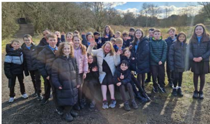
Kiltwalk prep with Mini Vinnies