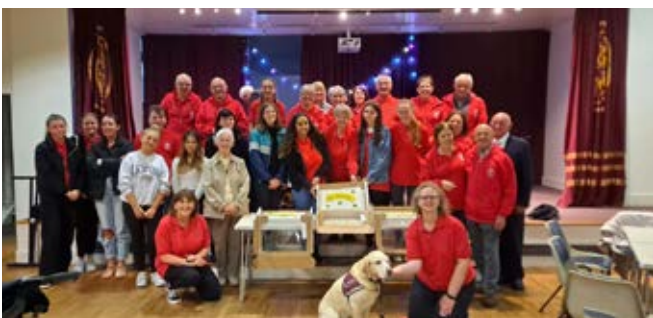
Group of the Red Shirts with the celebration cakes

Our Lady of the Wayside, Paisley continues their tremendous Vincentian work which includes operating a Soup Kitchen on a Friday evening, collecting & distributing basic food and toiletry provisions for parish clients within the Paisley Diocese as well as a new Lunch Club.