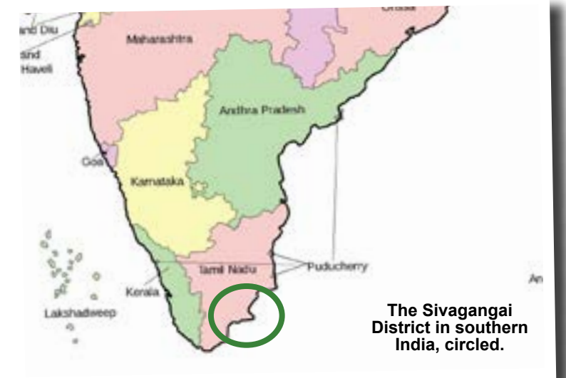
The Sivagangai District in southern India, circled.

Funds from the SSVP helped by these cows.