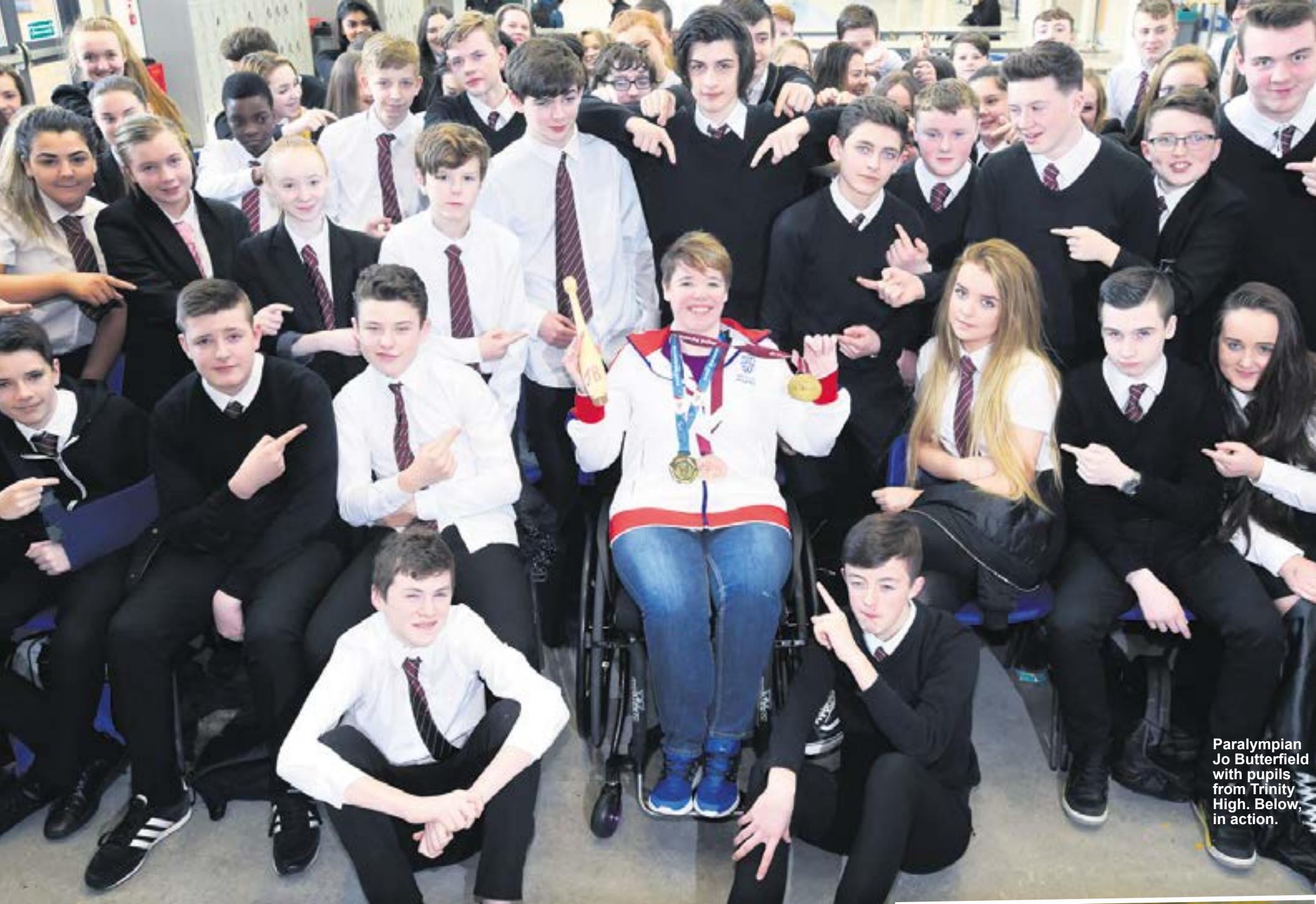
Paralympian Jo Butterfield with pupils from Trinity High. Below, in action.